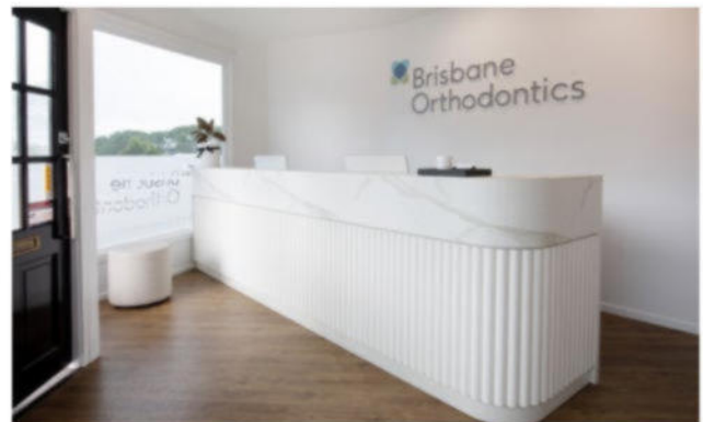
Designs By Dentifit | Dental – Medical – Veterinary